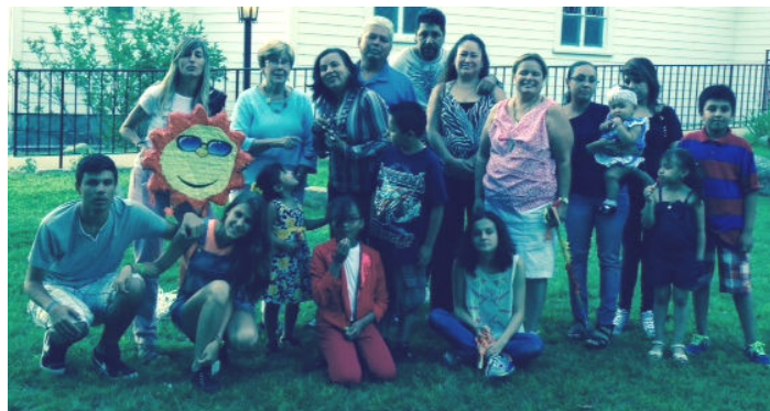
Thursday Evening Hispanic Ministry - Complete with Piñata!!