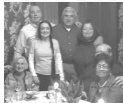
Cabin Fever Dinner #1 Cooks and Diners!