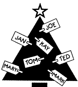
The Giving Tree

Make-Up = $45 Gifts = $36 Fuel = $326 All Saints Day = $5 Debt Reduction = $100 Philippines = $20. Faith Formation = $10 Maintenance & Repair = 20 Mito = $5 North Country Ministry = $97