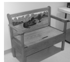
Boot Bench #2