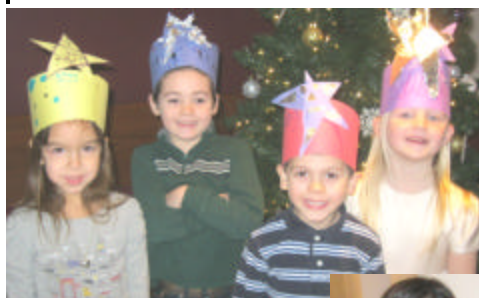
The Feast of the Two Queens and Two Kings!