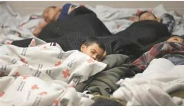
Detainees sleep in a holding cell at a US Customs and Border Protection processing facility.