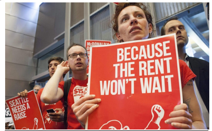
Labor activists hold signs during a Seattle City Council meeting June 2 in which the council voted on raising the minimum wage to $15 per hour.

Hence, the new question needed to be asked of the economy, specifically and of political arrangements generally, is about the dispositions necessary for a healthy society, one in which everybody flourishes because the economy cannot be measured only by the maximization of profits but rather in accord with the common good.